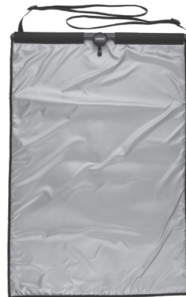
Door Press Pad Model GDPP1